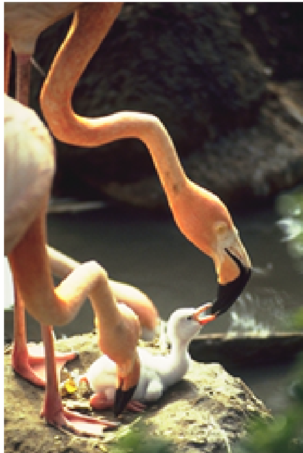
No D.I. column this month, but I hope you enjoy this photo of a flamingo and young

If you're up that way I can recommend a visit.